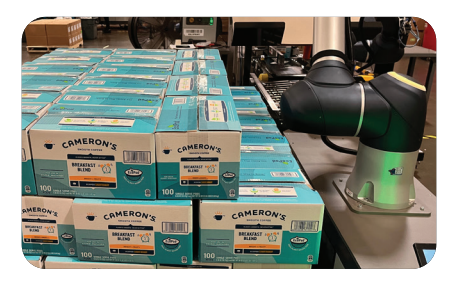
TARGET TRACKING Monitor cases produced, time to goal projections