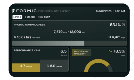
VISUAL CUES Bilingual and color coded performance, trendline direction