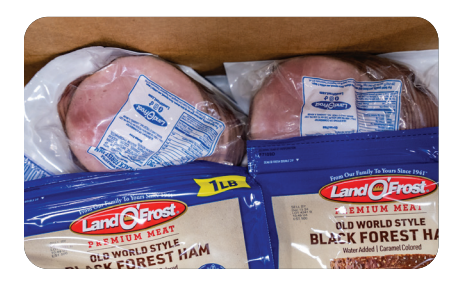
SKU SPECIFICS Production rates and trend analysis for SKUs on your line